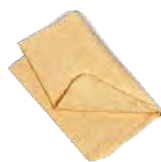
Plain Oven Cloth 19x 30" PO1930 £2.21

Disposables Aprons 27x44" BAOR01 Blue WAOR01 White RAOR01 Red YAOR01 Yellow GAOR01 Green £17.77 5 Rolls x 200