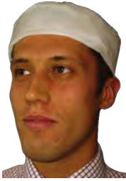
White Skull Cap Dispenser Box Non Woven One Size Adjustable