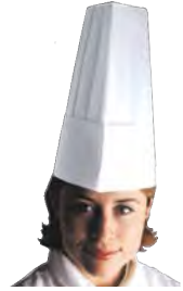
White Chefs Hats Paper (Flat Packed) H 230mm (9")