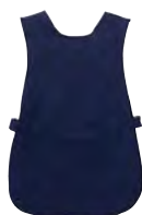
Navy Tabard 2436NV/SM 34-40" 2436NV/LXL 42-68" £14.89