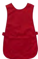
Red Tabard 2436RD/SM 34-40" 2436RD/LXL 42-68" £14.89