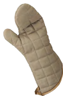
Flameguard Oven Mitt MIT17 17" Tan, 1 Pair £18.45

Flameguard - Extra thick cotton padding protecting up to 200° C. CE approved protection for hand, wrist & forearm.