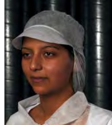
White Snood Cap One Size Adjustable

19300 White 19310 Blue 19320 Red 19330 Green 19340 Yellow £76.16 Pks of 1000