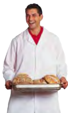
Mens White Food Coat- One Pocket Available in XS, S, M, L, XL, XXL, XXXL