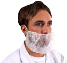
Disposable Beard Snood

15200 White 15210 Blue 15220 Red 15230 Green 15240 Yellow £36.46 Pks of 1000