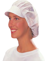
Net Peaked Hat