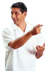
Baker Shirt, Short Sleeves Available in XS, S, M, L, XL, XXL, XXXL