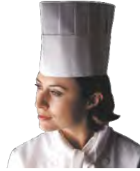
White Commis Chefs Hat Paper (Flat Packed) H 180mm (7")

466BS Blue Strip £14.89 466 White £14.89 Pks of 100