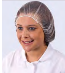
Mesh Hair Nets Nylon

14700 White 14710 Blue 14720 Red 14730 Green 14740 Yellow £21.11 Pks of 1000