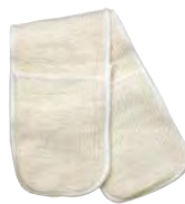
Oven Gloves Extra Long PH0730 £1.79