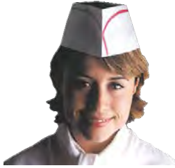
Forage Cap Dispenser Box Crown Tissue Paper One Size Adjustable

466BS Blue Strip £14.89 466 White £14.89 Pks of 100